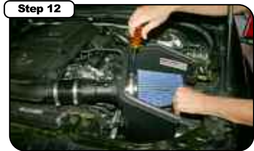
Step 12 Install the pre oiled air filter. Do not use any grease or oil. Secure with the provided clamp.