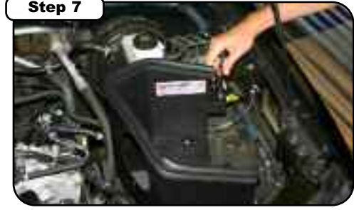
Step 7 Place the rubber trim seal along the edge of the housing. Lower the housing into the engine bay secure housing with the bolt removed in step 5.