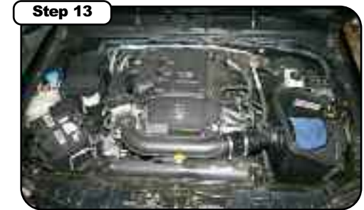
Step 13 Your installation is now complete. Make sure you tighten all clamps and check all electrical connections. Re check periodically.

Retighten all connections after approximately 100-200 miles. Place enclosed CARB EO sticker on or near the device on a smooth, clean surface. EO identification label is required to pass the smog inspection.