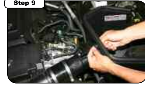
Step 9 Slide the intake tube assembly into the housing. Secure the tube to the housing with the supplied M6 hardware. Tighten and secure the hose clamp.