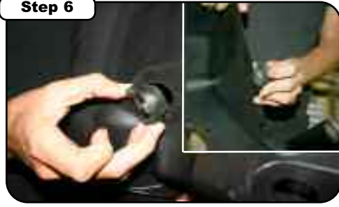
Step 6 Transfer the rubber vibration mounts located on the bottom of the air box over to the new housing.