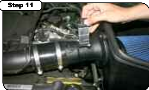
Step 11 Transfer the MAF sensor to the aFe intake tube. Secure with the supplied gaskets, spacers, and screws. Make sure you pay attention to the direction of the arrow on the MAF sensor.