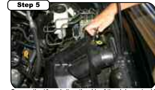
Step 5 Remove the 10mm bolt on the side of the air box set aside for later use. Lift the lower air box up and out of the engine bay.