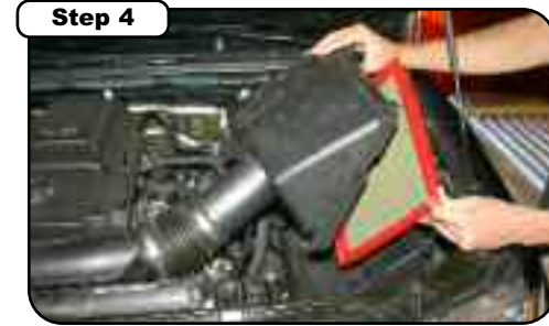
Step 4 Remove the upper portion of the air box and the factory air filter.