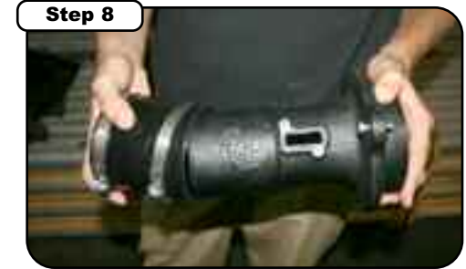
Step 8 Place the coupler on to the intake tube. Do not tighten clamps at this time.