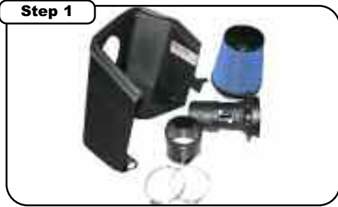
Step 1 Complete kit. Please verify all components are present prior to beginning installation.