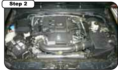
Step 2 Complete stock intake.