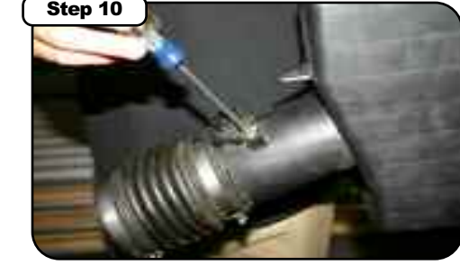
Step 10 Carefully remove the MAF sensor from the OEM air box lid.