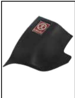
Intake System Cover