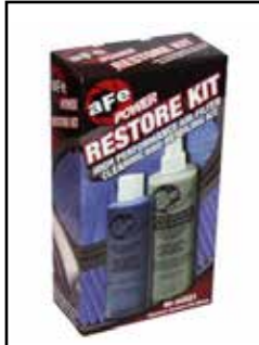
Pro 5R Restore Kit