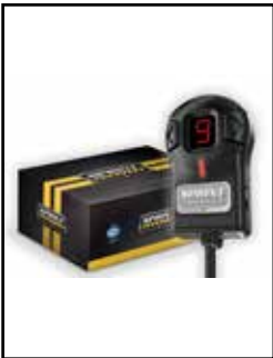
Sprint Booster V3