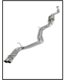
Cat-Back Exhaust System