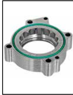
Throttle Body Spacer