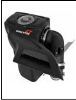
Momentum Intake System