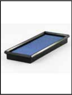
OE Replacement Air Filter