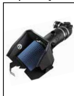
Intake System "Magnum Force"

P/N: 54-41262 (P5R) 51-41262 (PDS) 75-41262 (PG7)