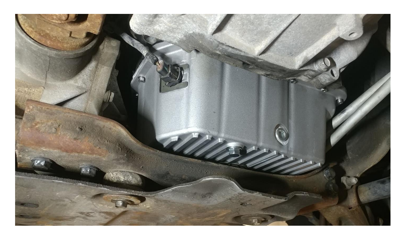
34. Once you reinstall the cross member, your installation is complete. Verify all connections are secure before driving.