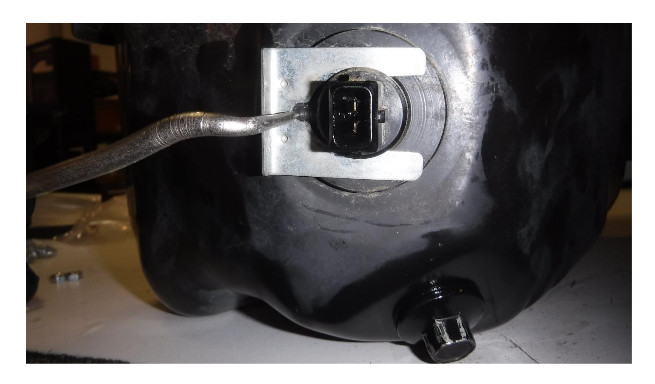
13. Pry the metal holding clip from the outside of the oil pan.