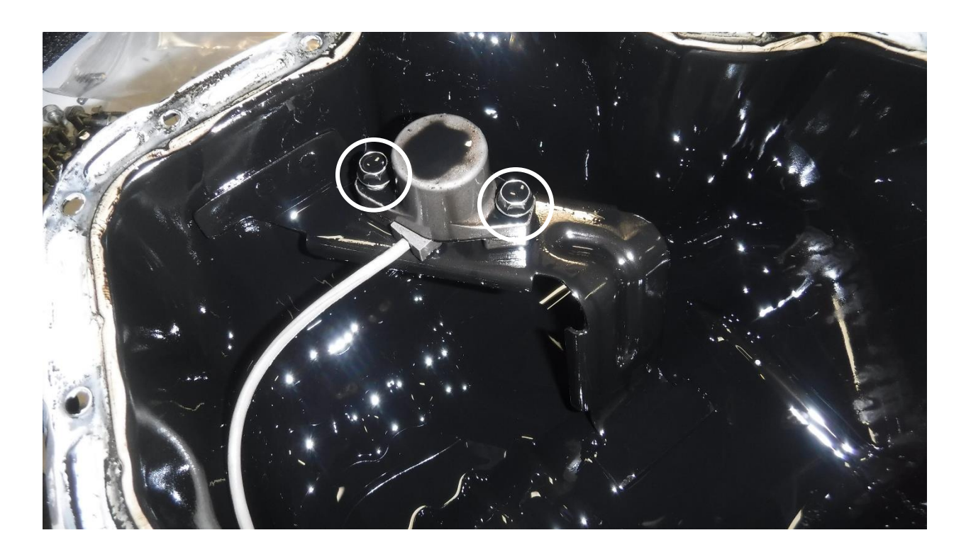
15. Remove the two (2) screws holding the sensor to the bracket inside the oil pan.