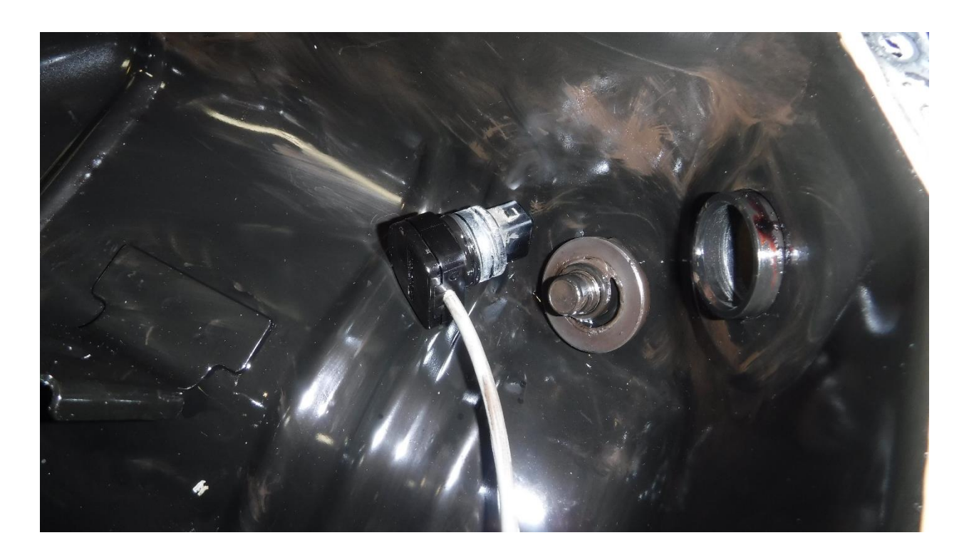
14. Once this holding clip is removed, push the connector towards the inside of the pan.