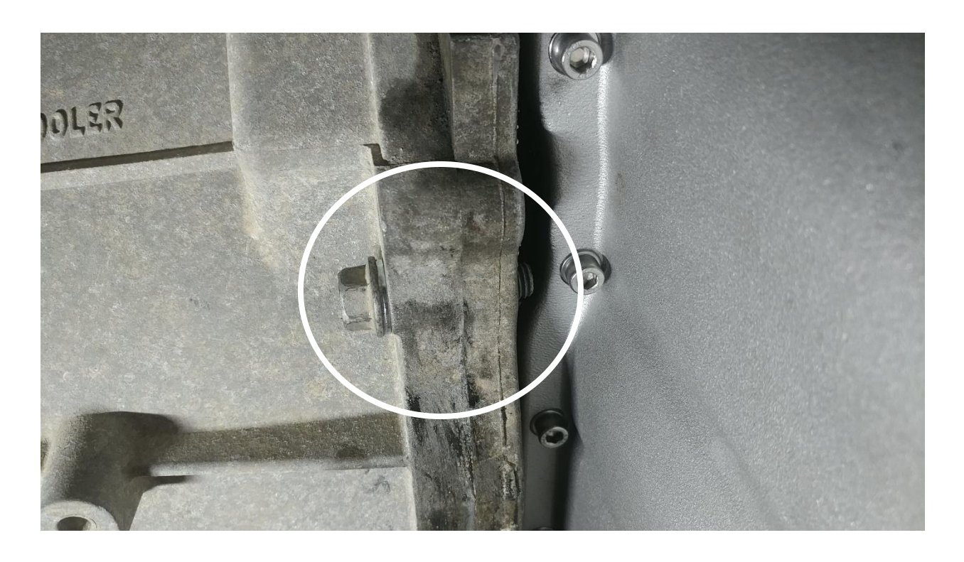
30. Re-install the transmission bolt removed in Step 11, using the supplied M10 washer.