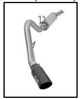
P/N: 49-43086-B (Blk. Tips) 49-43086-P (Pol. Tips)