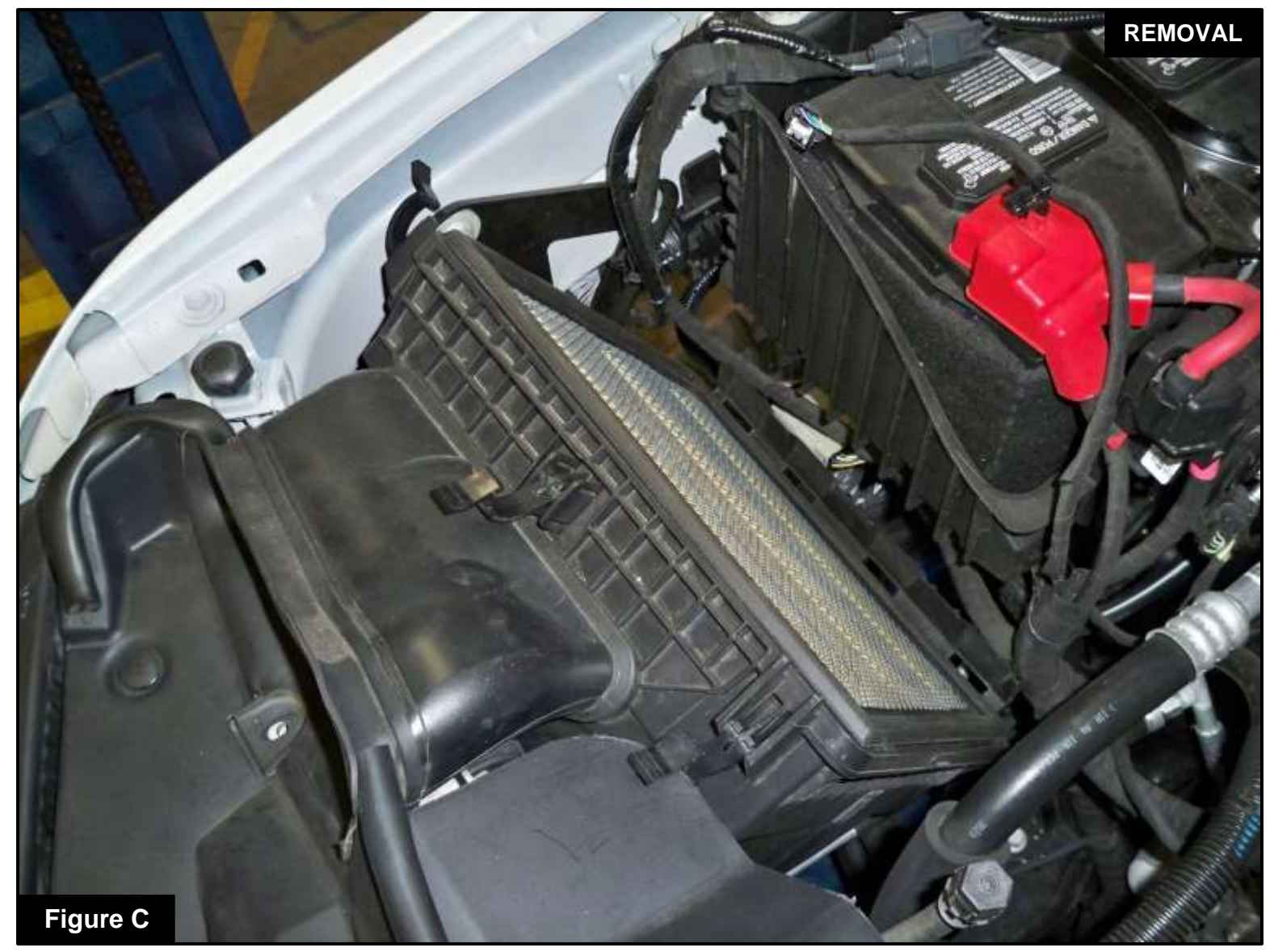
Refer to Figure C for Step 7