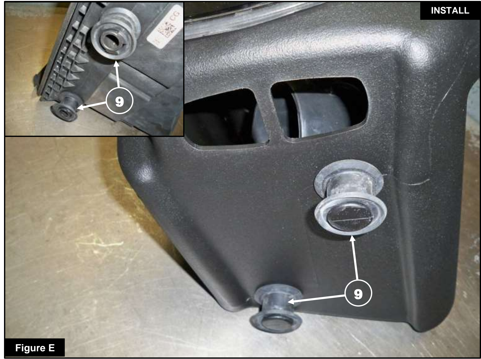
Refer to Figure E for Step 10