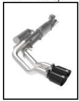
P/N: 49-43117-B (Blk. Tips) 49-43117-P (Pol. Tips)