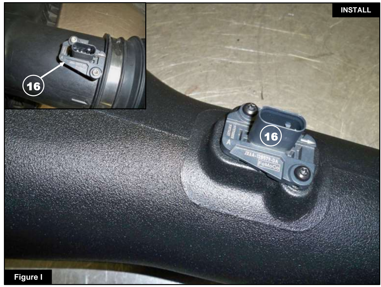
Refer to Figure I for Step 18