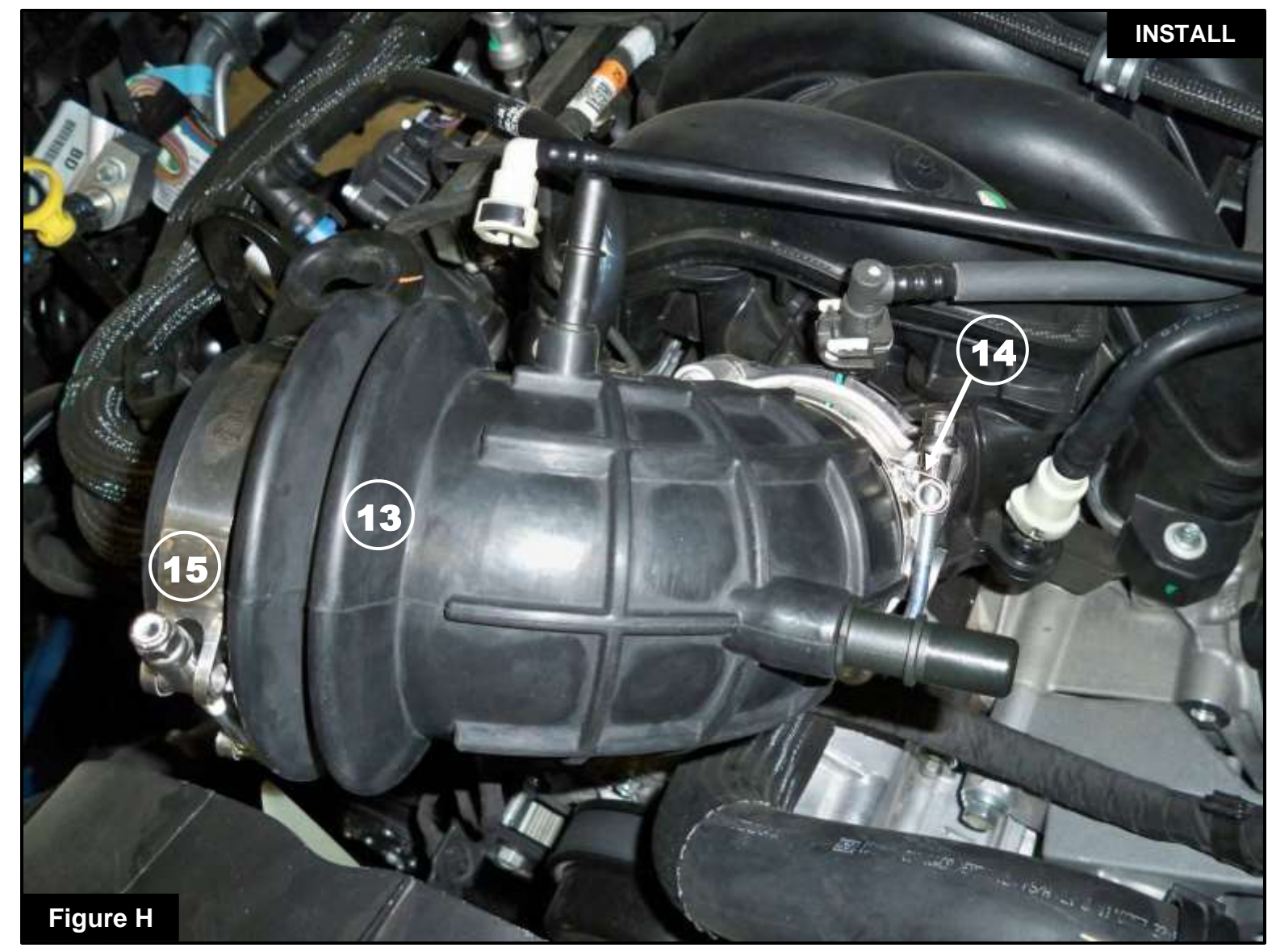
Refer to Figure H for Steps 16-17

Step 16: Place the supplied aFe POWER coupling (3) and TB387SS clamp (14) over the throttle body. Do not tighten.