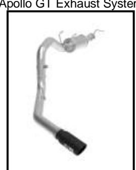
P/N: 49-43116-B (Blk. Tips) 49-43116-P (Pol. Tips)

To purchase any of the items above, view airflow charts, dyno graphs, photos, and video; please go to aFepower.com.