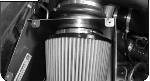
Install factory pre-oiled filter into housing. Install cover and make a final check for loose clamps, pinched wires etc. before starting engine.