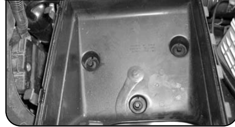
Remove lower half of filter box, unscrew 3 inserts and transfer inserts to new filter housing.