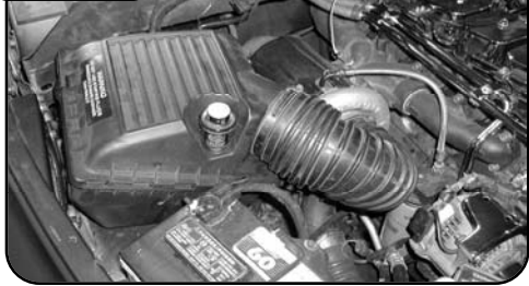
Complete stock intake.