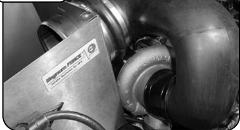
Slip boots over intake tube and install on turbo and filter housing. It may be easier to install clamps after tube is in position. If filter restriction gauge is desired, drill an 11/16 hole with a woodworking spade bit and transfer grommet and sensor to new intake tube. Sensor should be placed near larger end of tube for accurate results.