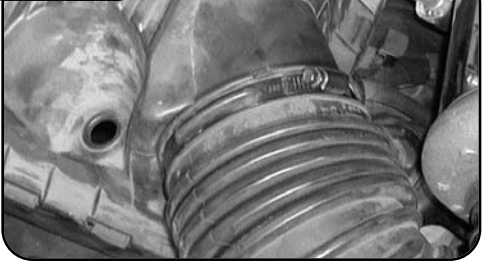
Loosen clamp at turbo inlet and remove top half of filter box and filter element.