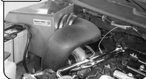
Make sure all clamps are tight and that all electrical components are secure. Check and retighten connections and filter after a few hours of operation.

Place the included CARB EO Sticker on or near the intake system on a smooth, clean surface. E.O. identification label is required in passing the Smog Check Inspection.