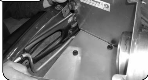
Lower housing into place, tab for ground screw tucks behind A/C line first, then lower to clear turbo housing. Housing should clear A/C line, line up rubber mounts and secure by pushing down hard or screwing mounts in. Install fender brace screw and ground screw and wire.