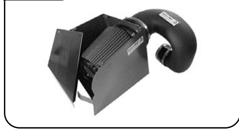
Complete kit with parts.