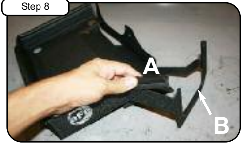
A) Attach 7/16" trim seal to top of housing. B) Attach rubber edge trim seal to ram air cut out on housing.