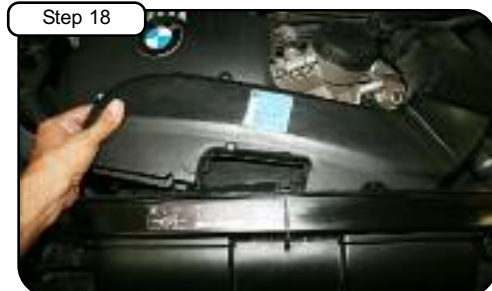
Pull back ram air duct and remove.