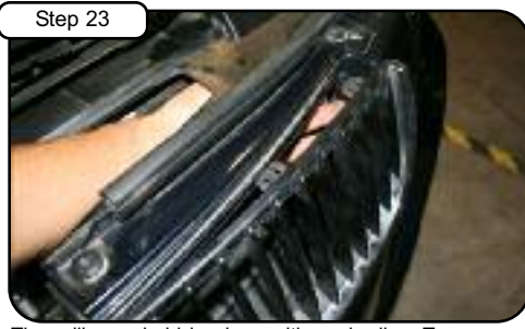
The grills are held in place with push clips. To remove, reach in behind each grill and push forward while using other hand to support grill fron the front.