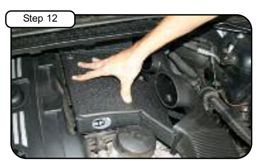
Push down housing allowing grommets to seat. Align threaded insert with hole on housing.