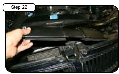
Lift and pull out cover.