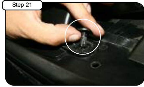
Remove plastic clip. Repeat steps 19-21 for remaining clip. (Save for later installation)