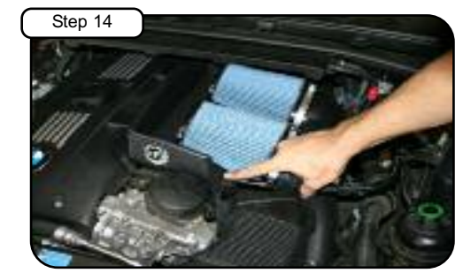
Install air filters and tighten with 5/16" nut driver and connect vacuum line.