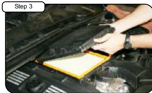
Unclip upper half of air box to remove lid and filter.