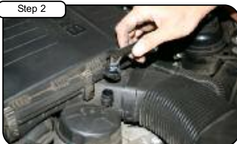
Disconnect vacuum line and pull back.