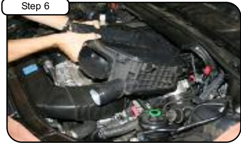
Remove complete air box from vehicle.