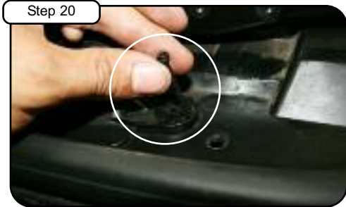
Remove plastic pin.