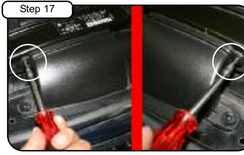
Remove screws on ram air duct using T25 torx bit. (Save for later installation)