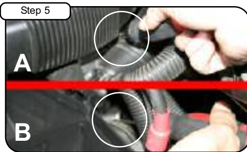
A) Loosen clamp closest to the radiator with 1/4" nut driver. B) Loosen clamp closest to fire wall with 1/4" nut driver. Leave clamps in position.