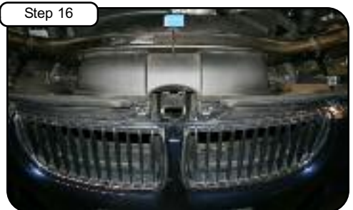
Complete Stock Configuration.