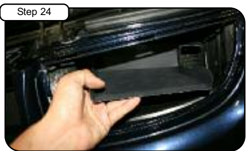
Install 05-01016 Driver side D.A.S.