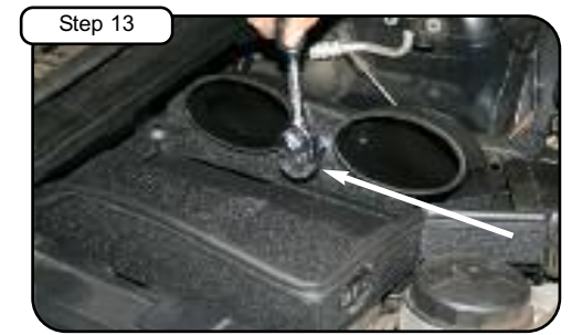
Install screw, washer and wavy washer provided, and tighten with 10mm socket or wrench. Tighten clamps to tube with 1/4" nut driver.