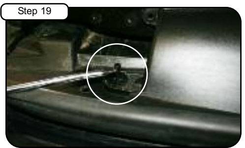
With flat head screwdriver, carefully pry and push up plastic pin.