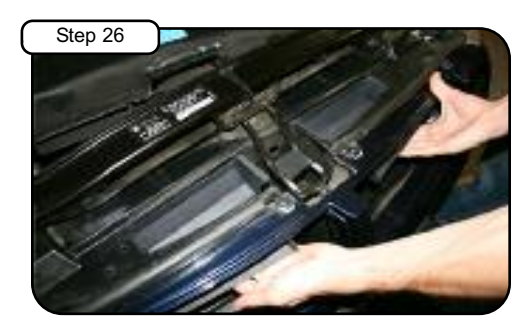
For easier installation, the next three steps will require an assistant. Have person A hold the scoops in position as shown.