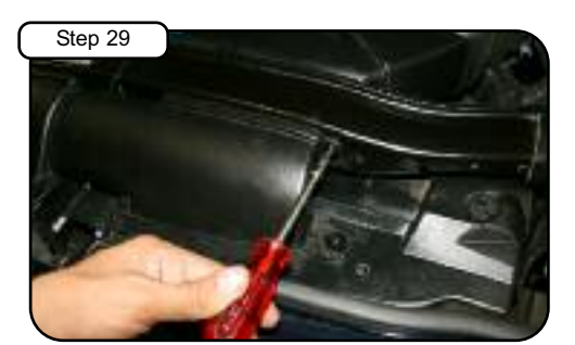
Re-position ram air duct from step 3. Secure using the 2 screws from step 17 and tighten using T25 torx bit.