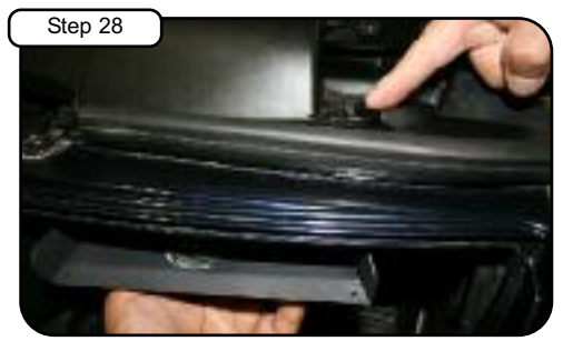
Detail of properly installed plastic pin clips. Make sure pin clips are through hole on scoops allowing to secure and hold in place!