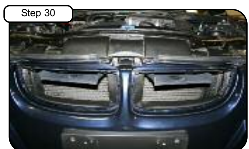
Your completed D.A.S. installation will look like this. Check and make sure they are secure. Re-install grills by lining up tabs and pushing them in until they snap into place.

NOTE: Place enclosed CARB EO sticker on or near the device on a smooth, clean surface. EO identification label is required to pass the smog test inspection.