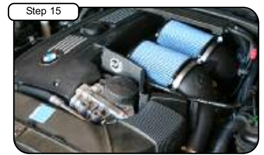
Your Intake installation is now complete. Please check all clamps and hoses periodically and tighten.

Continue to page 2 for D.A.S. Installation.