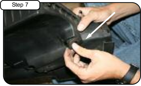
Remove the 3 rubber grommets from the air box. (To be used in step 9.)