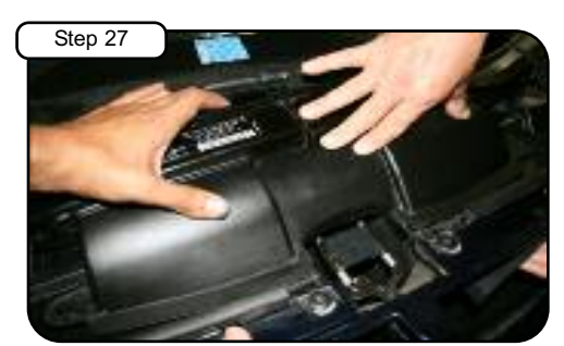
Have person B re-install the cover and secure with plastic pin clips that were removed earlier. (See steps 19-21)