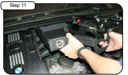
Install housing into factory postion.