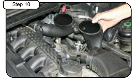
Install new tube into vehicle and pull back towards driver fender. Do not tighten clamps .