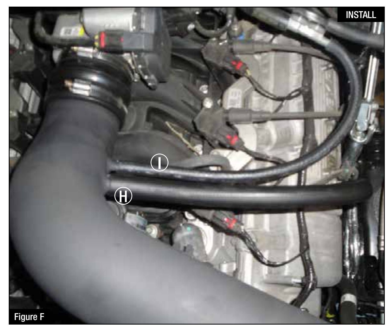
Refer to Figure F