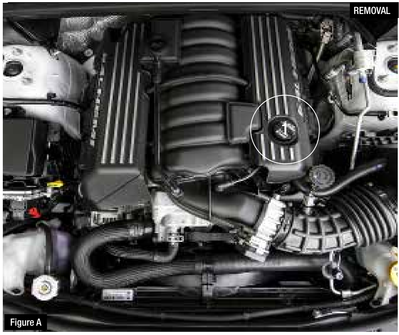
Refer to Figure A for Step 1

Step 1: Remove oil cap and cover trim. 1