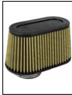
Pro-GUARD 7 Air Filter