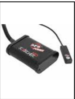
SCORCHER HD Module