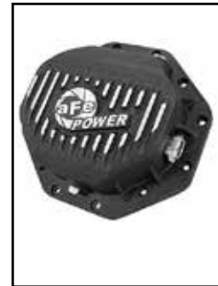
Rear Differential Cover

P/N: 46-70272 (Blk/Machined) 46-70270 (RAW)