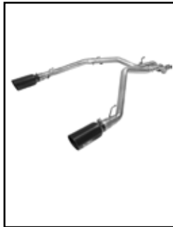
3" DPF-Back Exhaust

P/N: 49-42044-B (Blk Tips) 49-42044-P (Pol Tips)