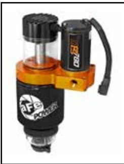
DFS780 Fuel System