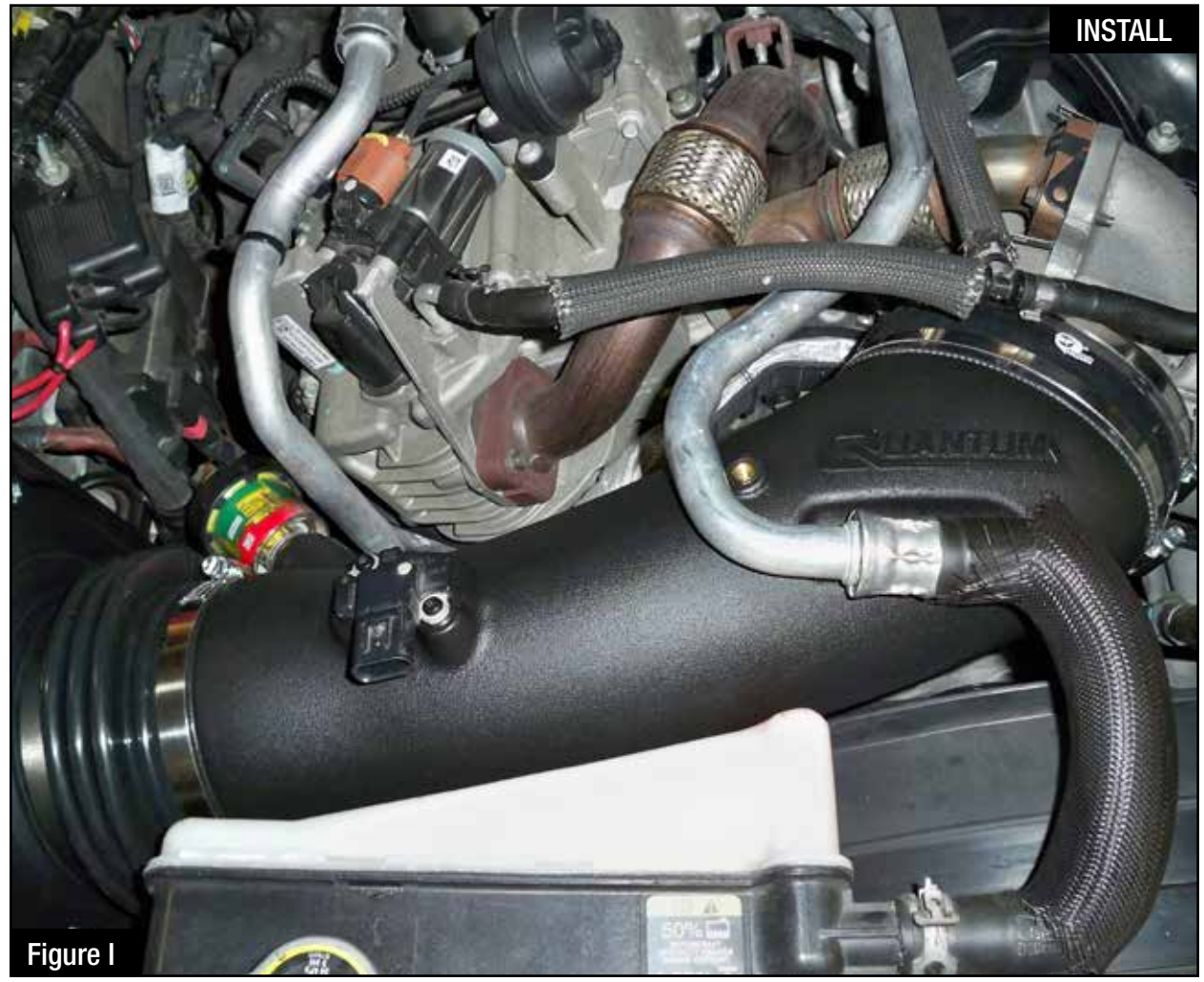
Refer to Figure I for Step 15

Step 15: Slide the aFe intake tube into the coupling at the filter, then install the intake tube into the coupling at the turbo inlet. Tighten all the clamps with an 8mm nut driver.