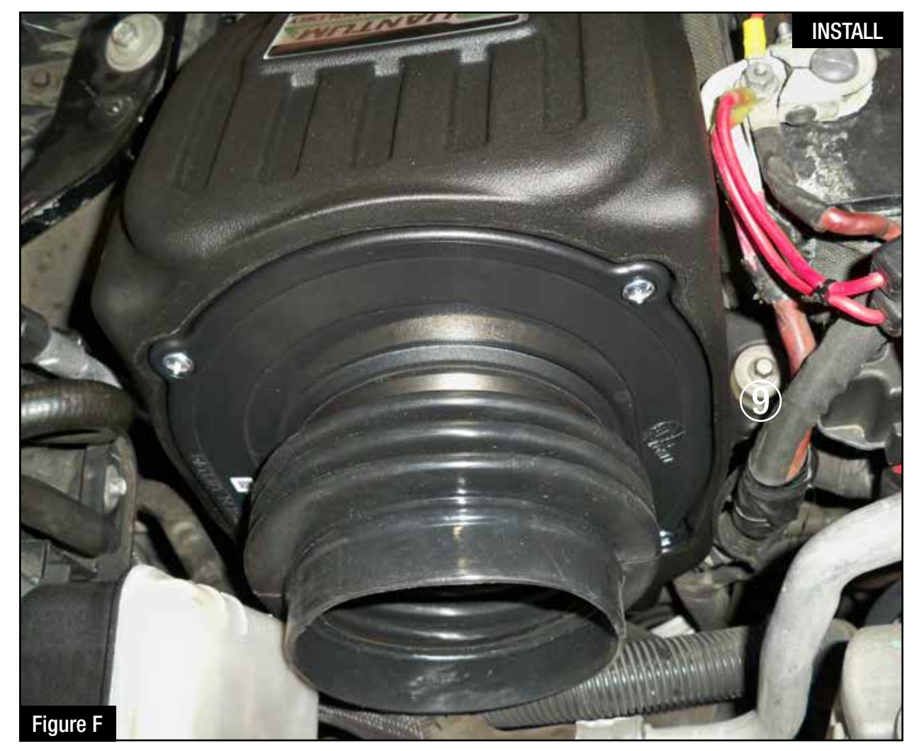
Refer to Figure F for Step 9