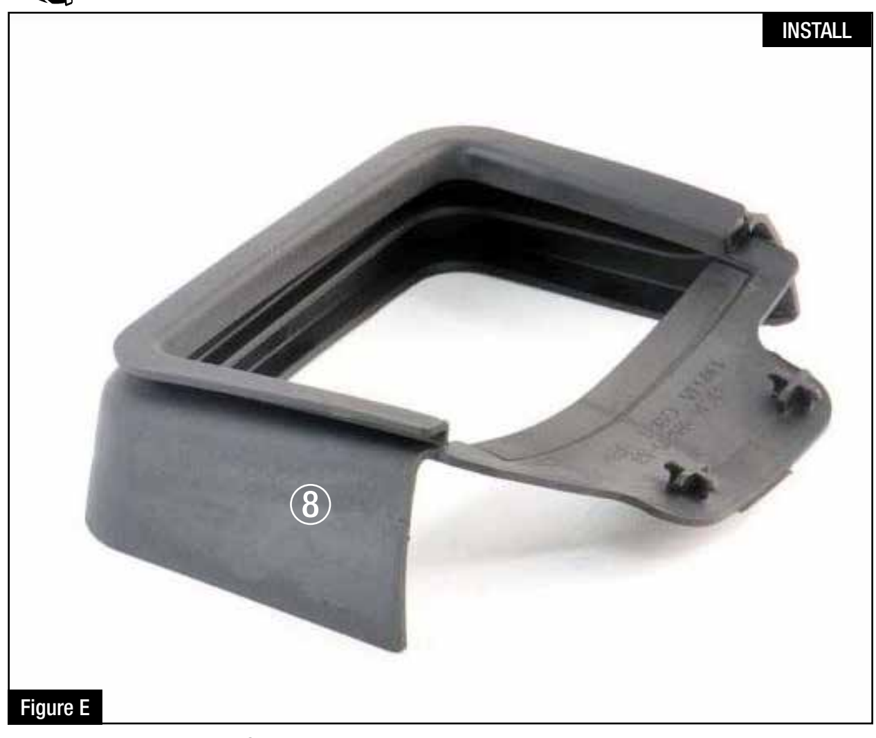
Refer to Figure E for Step 8

Step 8: Remove the rubber inlet gasket (8) from the OE airbox and install it on the aFe housing.