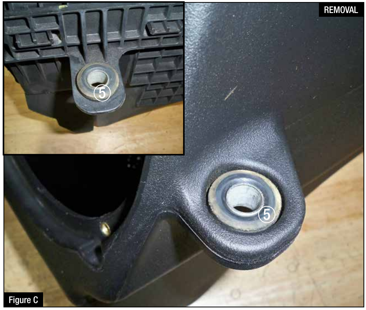
Refer to Figure C for Step 5