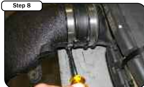
Step 8 Loosen the clamps holding the OE intake tube to the OE air box. Remove the tube.