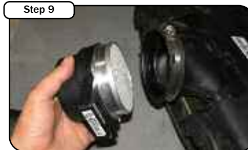
Step 9 Remove the MAF sensor from the OE air box.