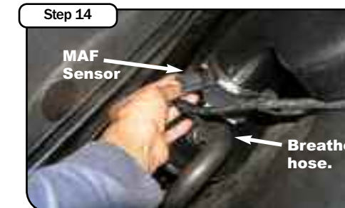
Step 14 Reconnect the MAF sensor and air inlet hose to the air filter.