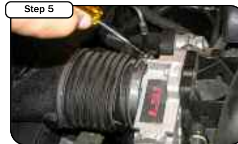
Step 5 Loosen the clamp holding the OE intake tube to the throttle body.