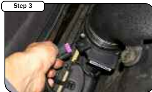
Step 3 Remove MAF sensor plug.