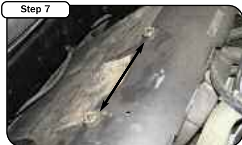
Step 7 Place the two rubber grommets on the two pins located on the engine cover.