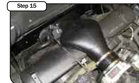
Step 15 Your installation is now complete. Make sure you tighten all clamps and check all electrical connections. Re-check periodically. Place the included CARB EO Sticker on or near the intake system on a smooth, clean surface. E.O. identification label is required in passing the Smog Check inspection.

Note: Filter Cleaning and Re-oiling: When cleaning your aFe filter, be sure to use only aFe's "Restore Kit" (aFe P/N: 90-50001 blue oil aerosol, or aFe P/N: 90-50051 blue squeeze bottle oil or aFe P/N: 90-50000 gold oil aerosol, or aFe P/N: 90-50500 gold squeeze oil). Filter Replacement: Magnum FLOW PN: 24-90033 (black w/blue media). Pro Dry S™ P/N: 21-90033 Pro Dry S™ cleaning: see cleaning instruction sheet 06-00074