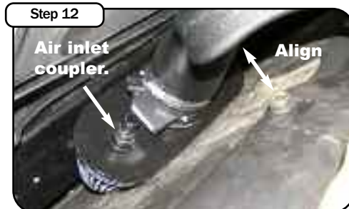
Step 12 Insert the air hose inlet coupler into the air filter. Sit the intake into position aligning the two rubber grommets with the dimples on the aFe intake tube.