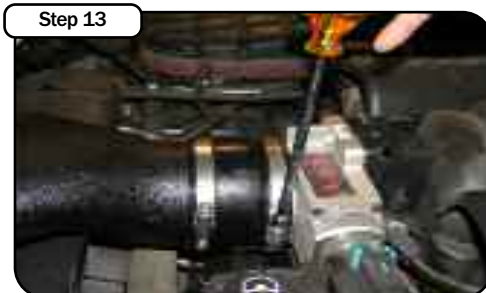
Step 13 Secure the coupler onto the throttle body and secure in position.