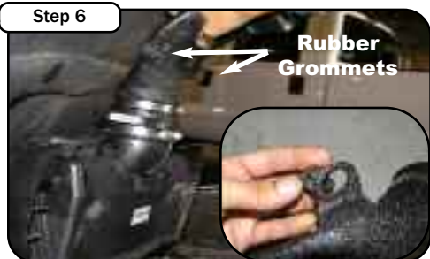
Step 6 To remove stock housing lift up and pull out. Remove the two rubber grommets on the OE intake tube. Store these items for future use if needed.