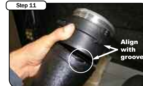
Step 11 Insert the MAF sensor into the aFe intake tube. Make sure to align the MAF sensor to the notch on the intake tube. This assembly requires a snug fit. If fit is too tight the tube can be heated with a hair dryer or heat gun to allow insertion.