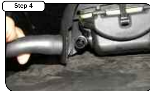
Step 4 Unplug the air breather hose.