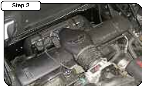
Step 2 Complete stock intake.