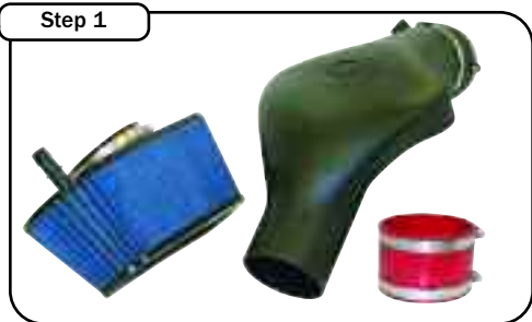
Step 1 Complete kit. Make sure all components listed are included prior to beginning installation.