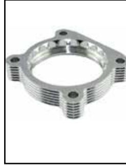
aFe Throttle Body Spacer