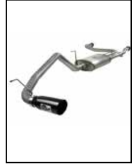
aFe Exhaust System