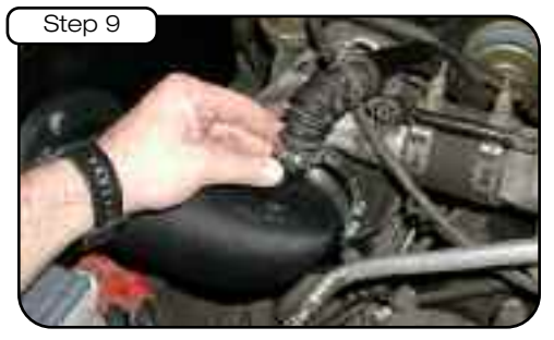
Place crankcase breather elbow onto the nipple of the plastic tube and re-tighten the coupler, be sure to not over-tighten the coupler.