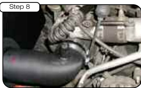
Tighten the remaining clamp securing the tube to the turbo coupler.