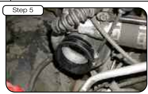
Place provided coupler onto turbo and secure the turbo end by tightening provided clamp.