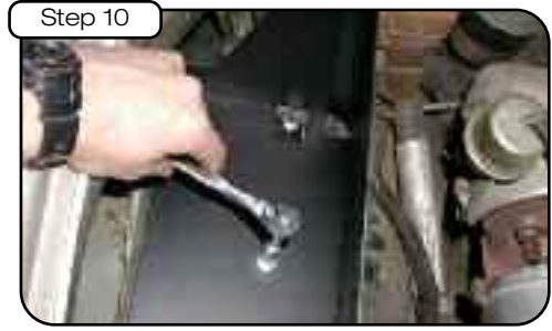
Using remaining M8 hardware and the existing holes in the fenderwell, secure the heat shield to the fender well. Tighten the hardware.