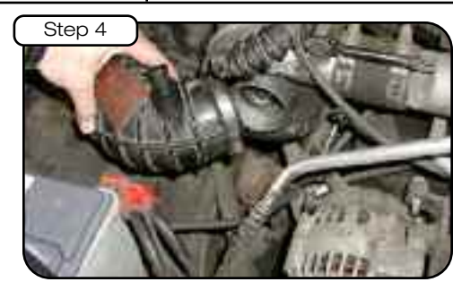
Remove factory rubber elbow at turbo.