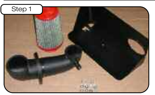
Complete kit components