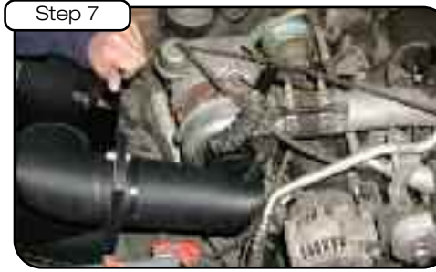
Before placing the heat shield into the engine compartment, slide the remaining clamp over the turbo coupler. Insert turbo end of the plastic tube into the coupler and rotate the assembly to seat the heat shield.