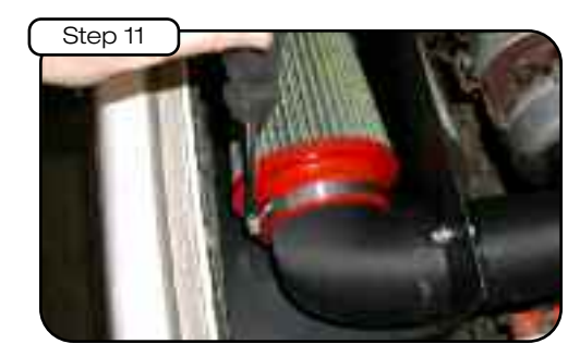
Install provided aFe filter onto the plastic tube and tighten.