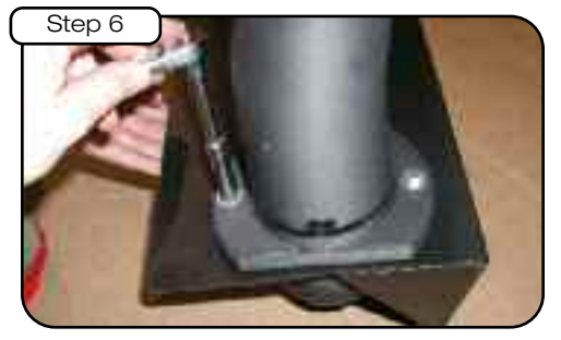
Insert tube into heat shield with flange on outside. The longer side of the tube should be facing outside of the heat shield. Secure using provided M6 hardware; be sure to use one washer for each side of each bolt, DONT over-tighten.