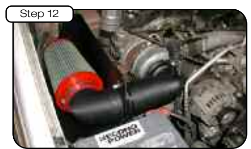
Complete aFe kit installed. Check and retighten all connections after first few hours of operation. NOTE: Place enclosed CARB EO sticker on or near the device on a smooth/clean surface. EO Identification label is required to pass the smog test inspection.