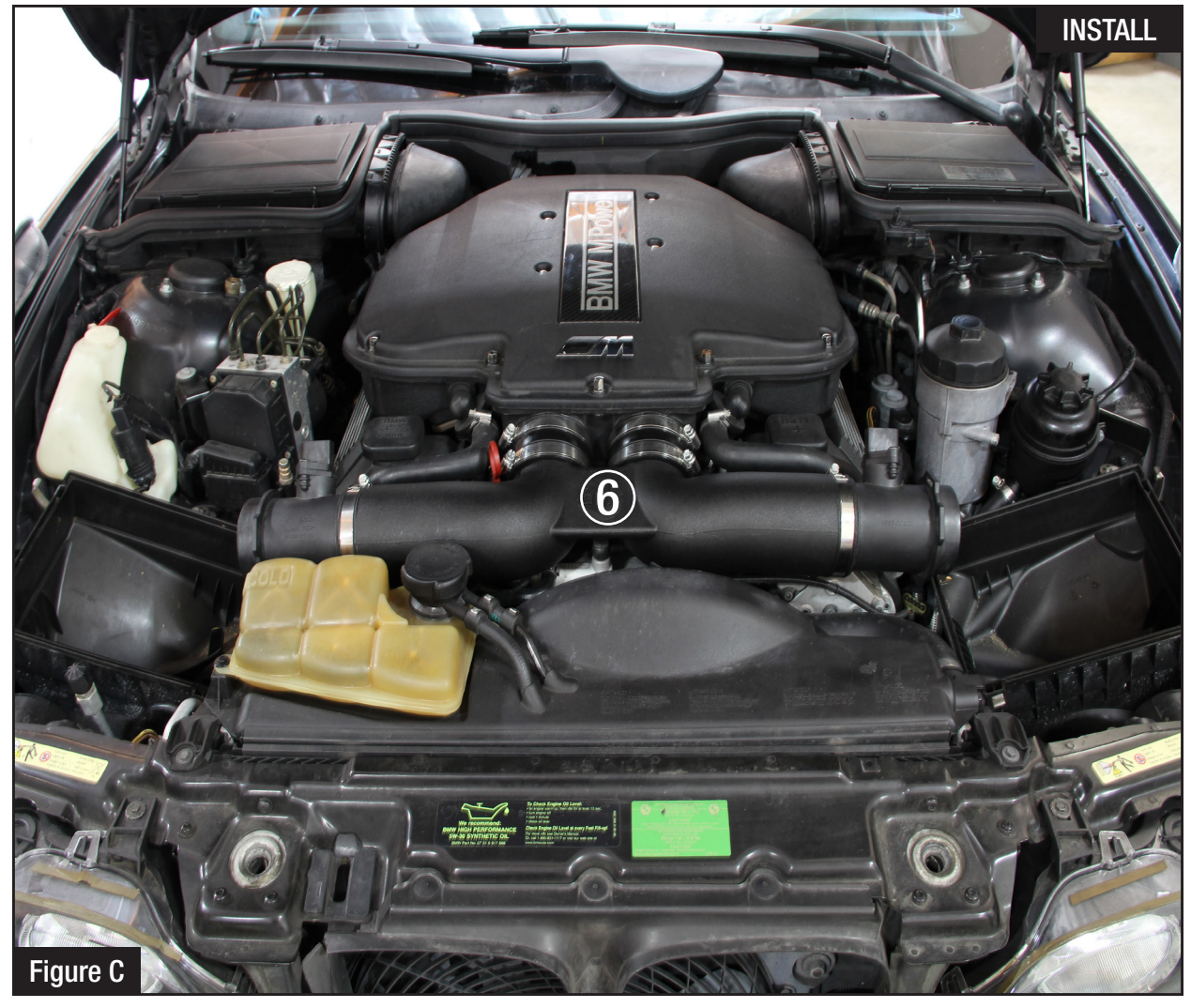
Refer to Figure C for step 8

Step 8: Install the aFe intake tube into the vehicle 6 using the supplied straight couplings and clamps.