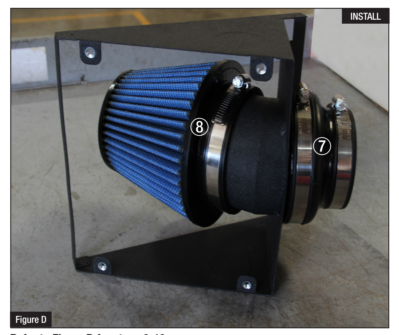
Refer to Figure D for steps 9-10

Step 9: Install the supplied reducer couplings onto the aFe housings with the supplied clamps 7. Step 10: Install the aFe air filter onto both housings 8 (Make sure the filters are installed as low as they can go or you will have problems installing the covers).