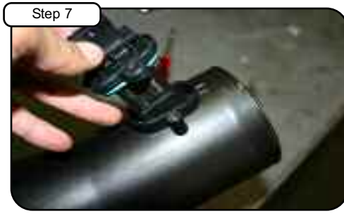
With provided T20 torx bit loosen the 2 bolts that hold in the MAF sensor. Carefully remove MAF sensor out.