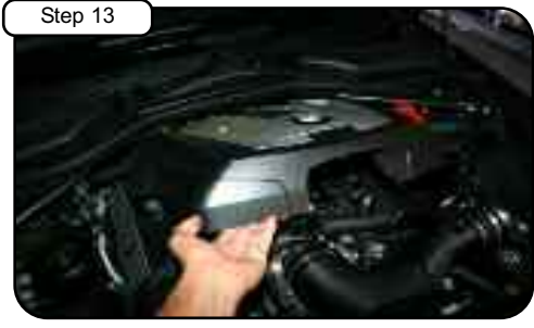
Re-install OE engine cover.