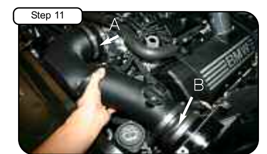
Place couplers with clamps provided on to tube and install new tube in to vehicle. A) coupler 05-00020