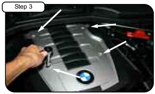
Remove the 4 bolts holding the factory engine cover with 10mm socket w/ ratchet. Remove engine cover.