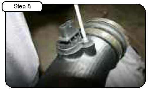
With M4 screws, gasket, and spacers provided, place MAF sensor in to new tube. (make sure gasket is between tube and sensor)