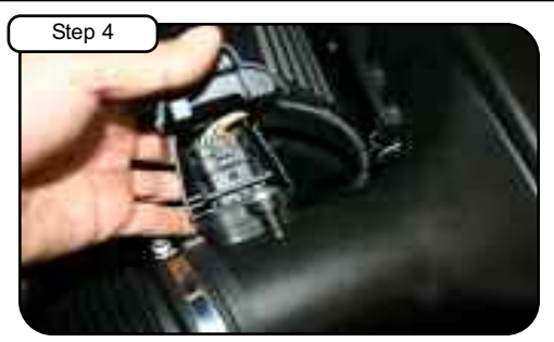
Remove te MAF sensor cover. Disconnect the MAF harness from sensor