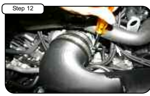
Tighten clamps using 5/16" nut driver.