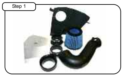
Complete kit with parts.