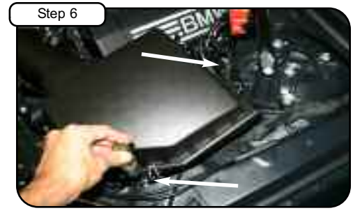
With T25 torx bit, loosen the 2 bolts that hold the OE airbox in place. Carefully remove the airbox out of vehicle.