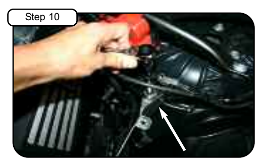
With OE T25 bolt, use to tighten new housing in to place. Tighten at botton of housing using nut and washer provided with 10mm socket w/ extension.