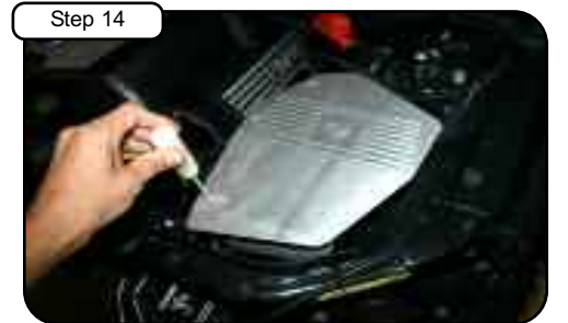
Place high FLOW filter into housing and tighten using 5/16" nut driver. Install housing cover using the 3 button head screws and tighten using 5/32" allen key.