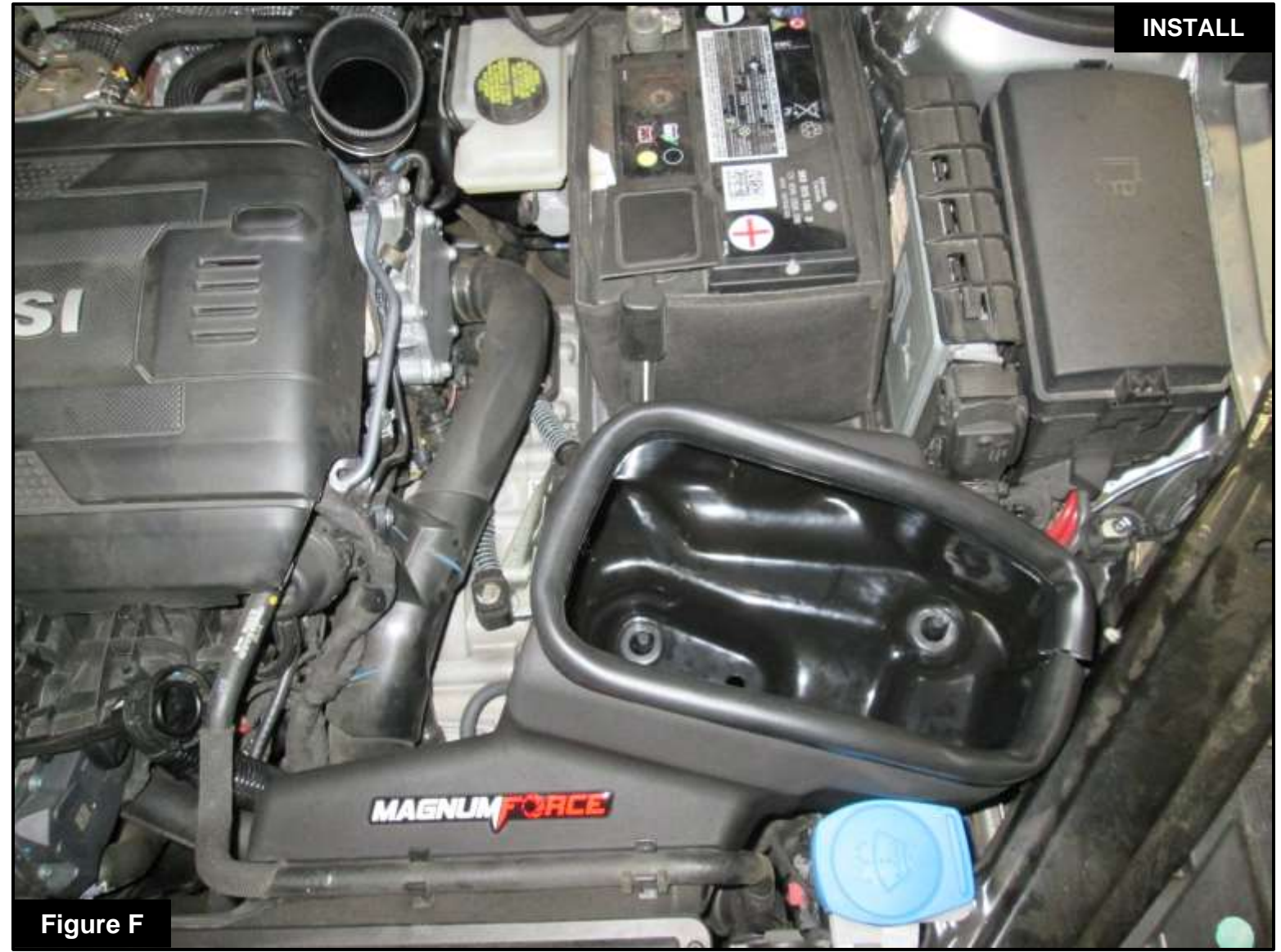
Refer to Figure F for Step 11