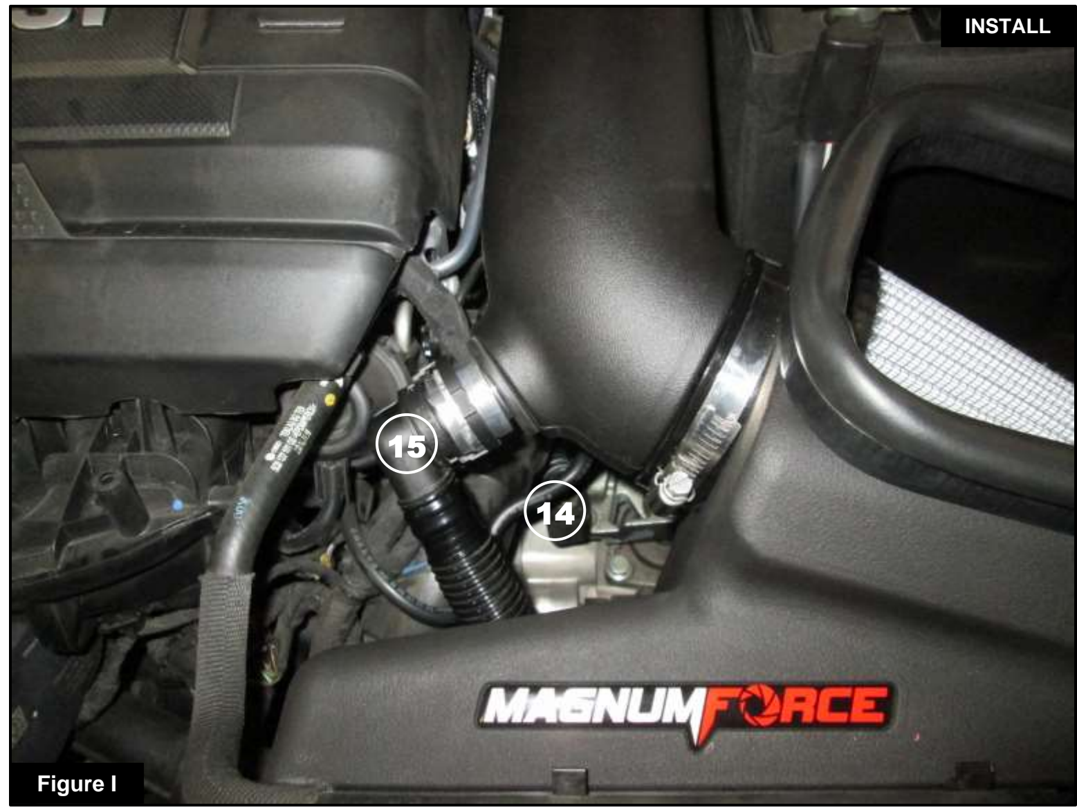
Refer to Figure I for Steps 14-15

Step 14: Reconnect the crank case breather line 14 to the fitting on the bottom of your intake tube. Step 15: If your vehicle is equipped with a smog pump, connect the smog pump line 15 to the fitting installed on your intake tube.