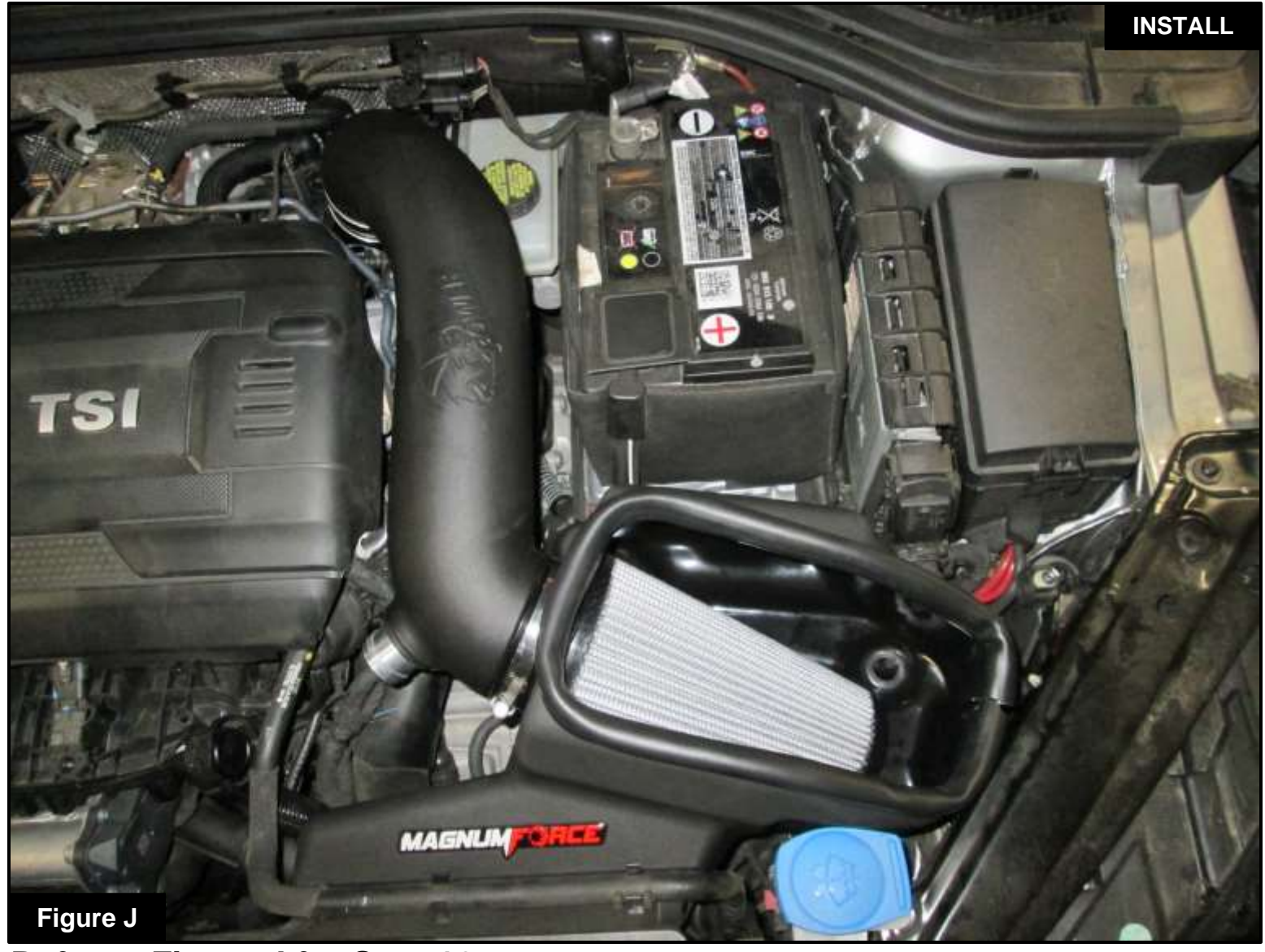
Refer to Figure J for Step 16

Step 16: Confirm that all connections are secure and clamps tightened. Your installation is now complete. Thank you for choosing aFe POWER!