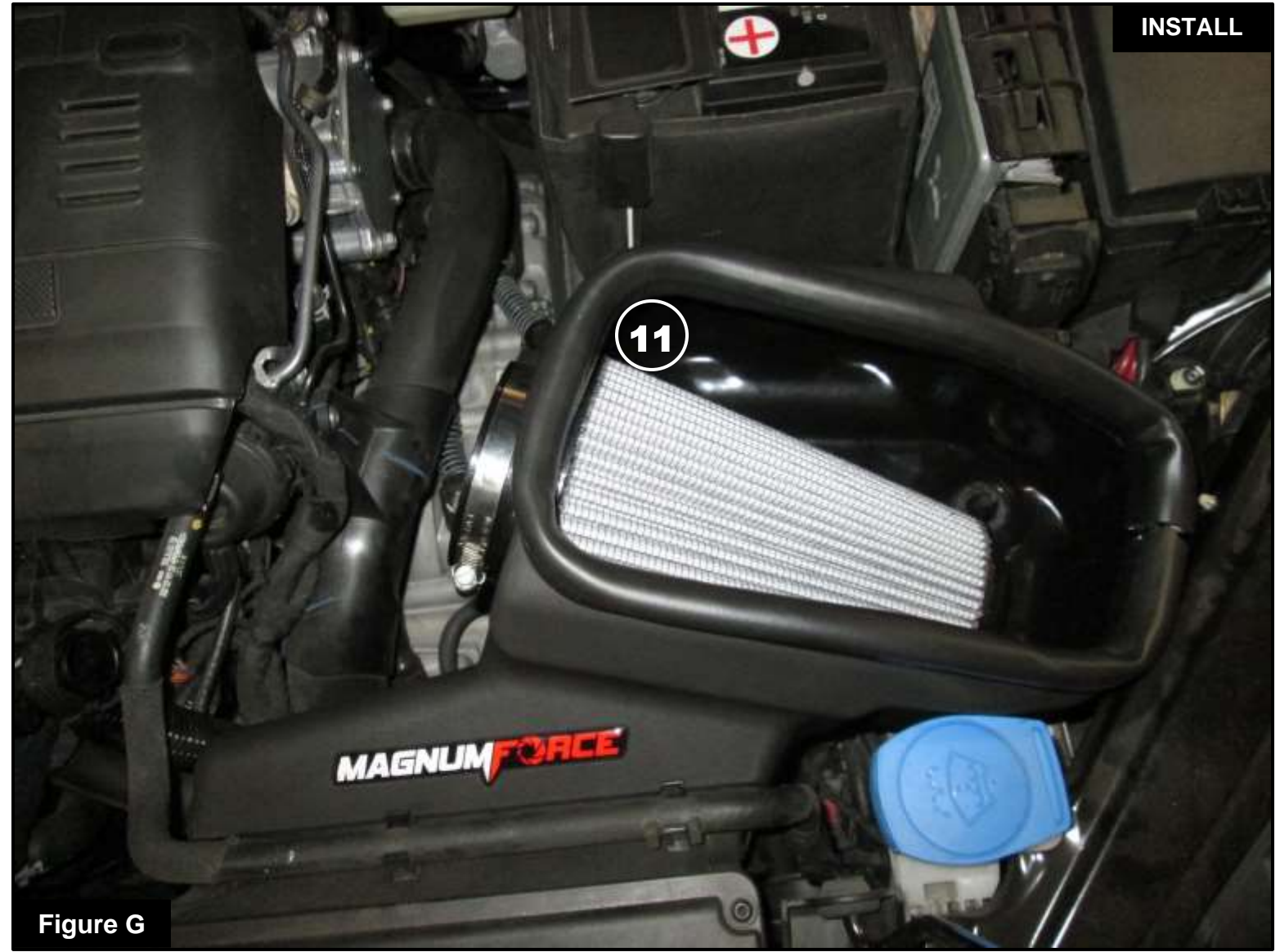
Refer to Figure G for Step 12

Step 12: Install your aFe Power air filter 11 into the housing through the top opening, ensuring that the retention bumps are on the outside of the housing. Place the filter clamp loosely on the filter opening.