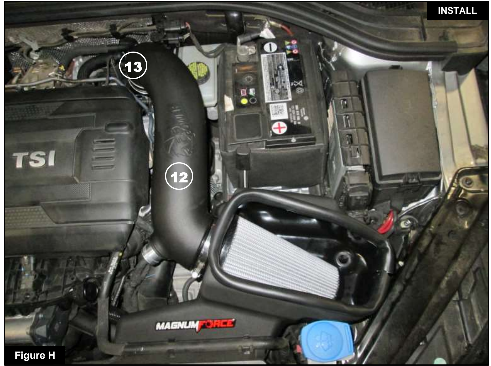
Refer to Figure H for Step 13

Step 13: Install your aFe Power intake tube (2) with the remaining #048 clamp (13) into the vehicle by inserting into the filter first, then rotating down into the coupling at the turbo inlet. Tighten all of the clamps using an 8mm nut driver.