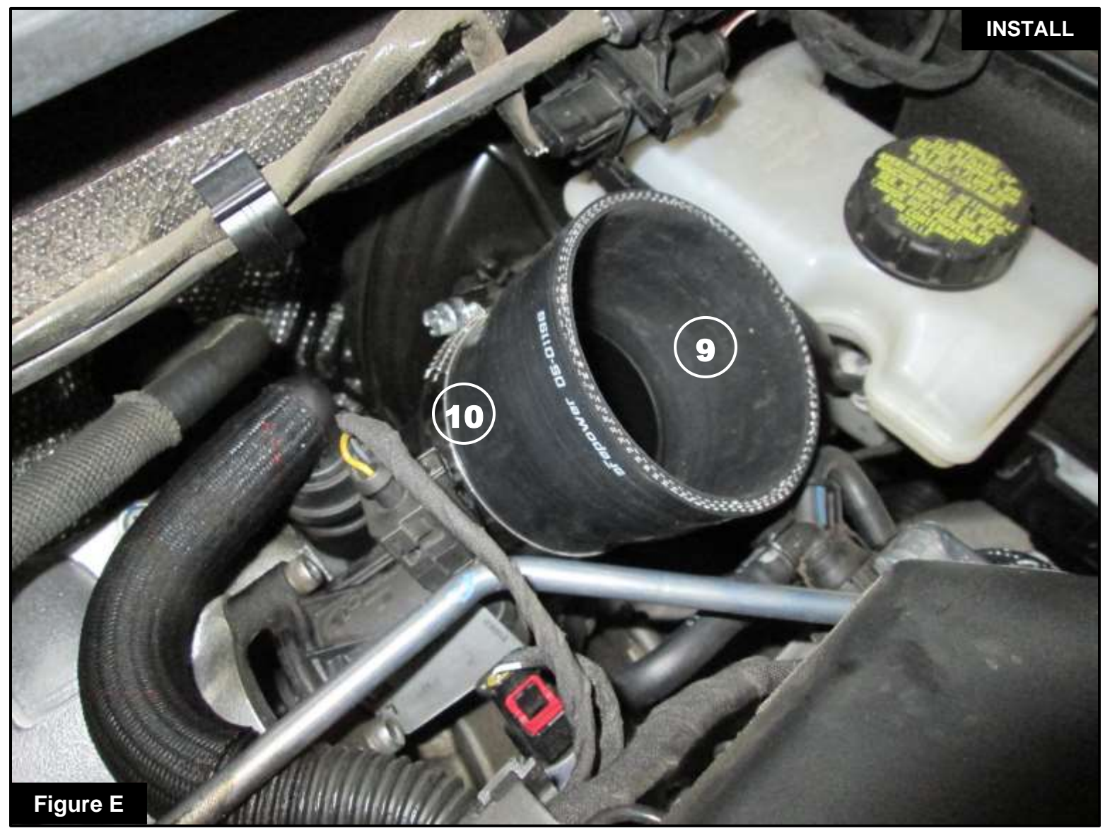
Refer to Figure E for Step 10