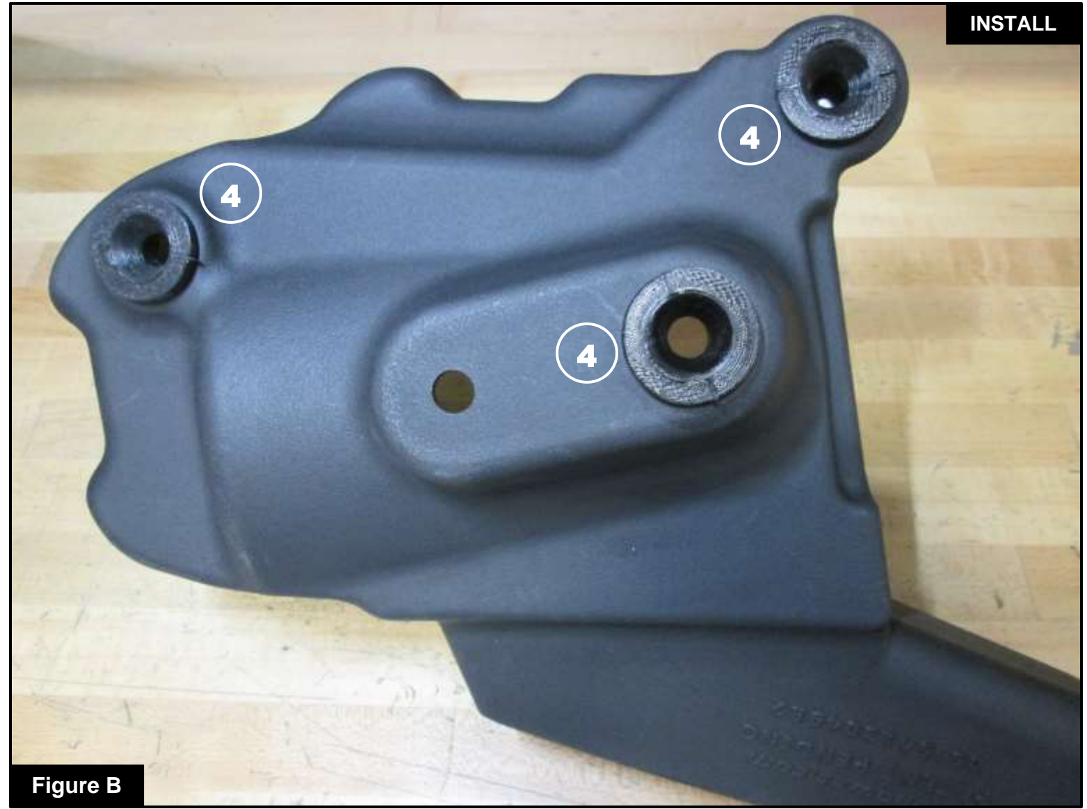
Refer to Figure B for Step 5

Step 5: Install the supplied grommets 4 in the three mounting holes on the bottom of your aFe Power housing as shown.