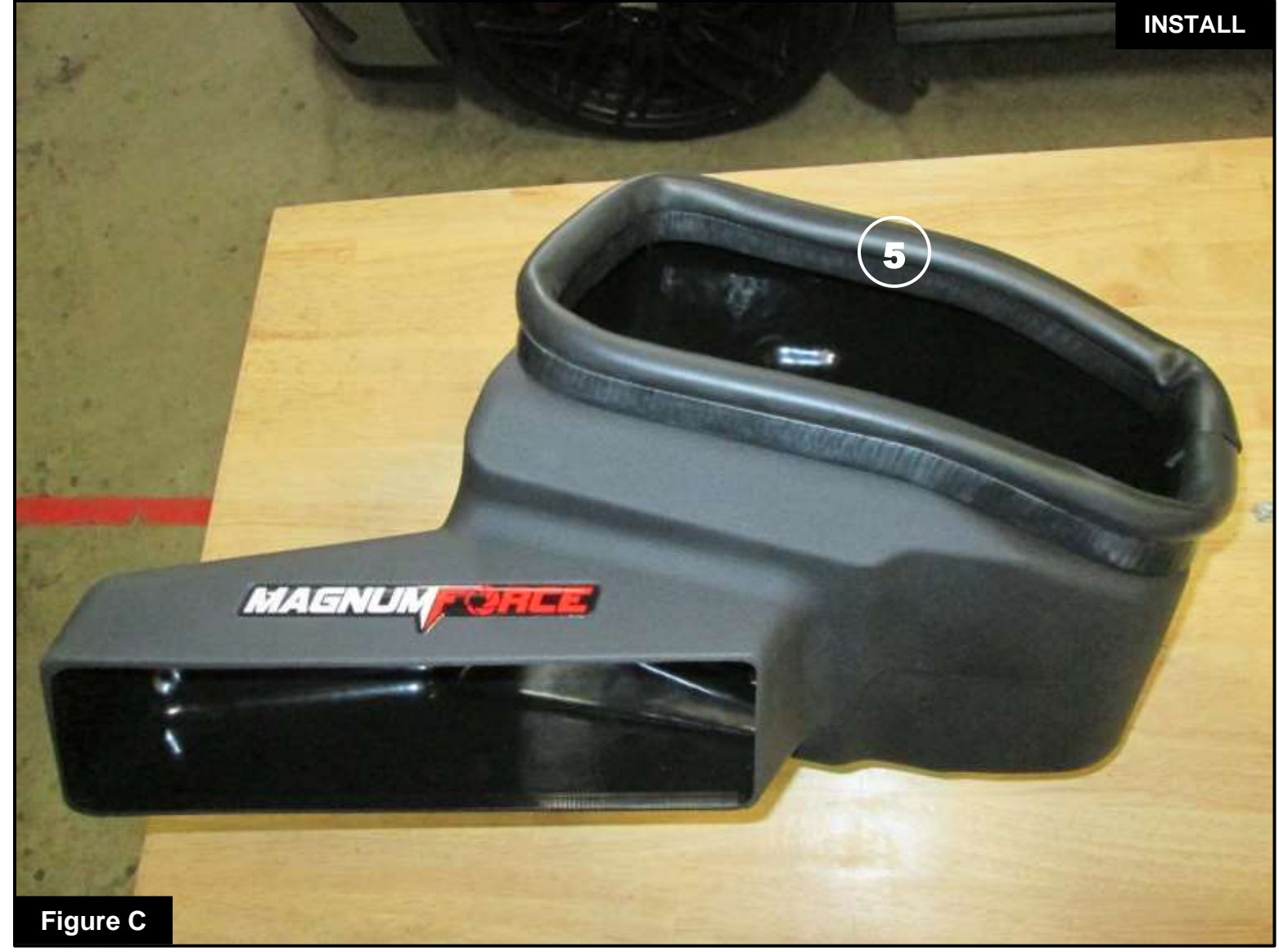
Refer to Figure C for Step 6

Step 6: Install the supplied seal trim 5 along the top opening of the housing as shown. Trim to fit as necessary.