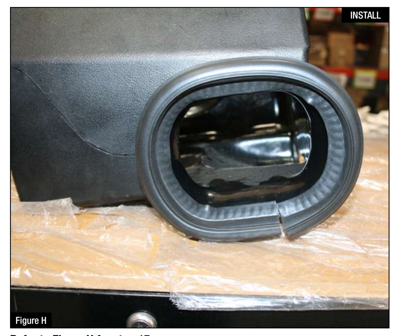
Refer to Figure H for step 17