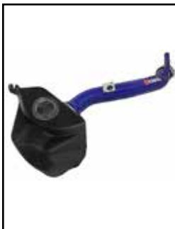
Cold Air Intake System