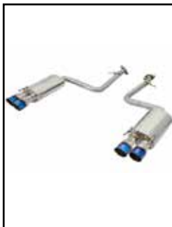
Axle-Back Exhaust System

P/N: 49-36037-P (Pol. Tips) 49-36037-L (Blue Tips)