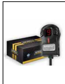
Sprint Booster V3

P/N: 49-36037-P (Pol. Tips) 49-36037-L (Blue Tips)